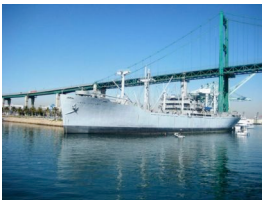
The Lane Victory, WWII troop transport

emphasizing the environment and "ship-to-shelf" goods movement, also pointed out sites of historical interest.