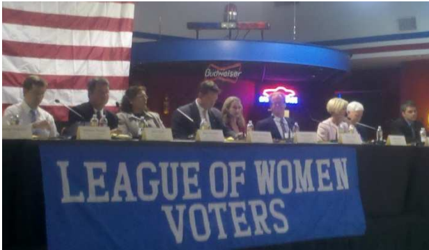
Most of the candidates for the 36th Congressional District Primary Forum on May 2