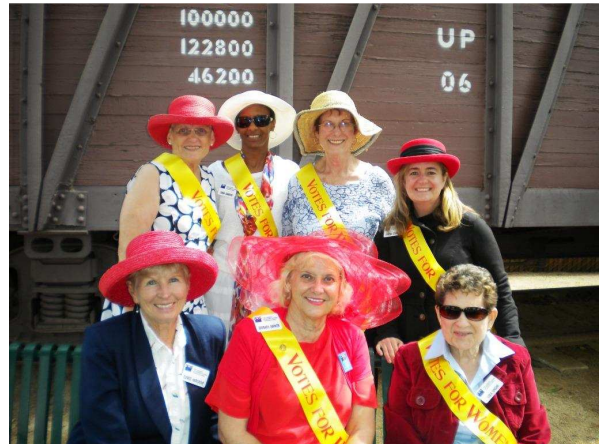
League members were given special attention for the 100th Anniversary of California Women's Right to vote when they attended the Lomita Railroad Museum Foundation Annual Tea on Sunday, May 22